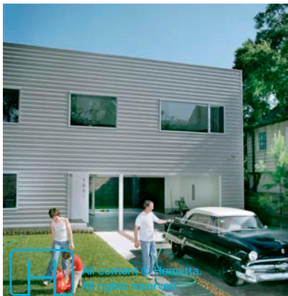
All content © Hismetta All rights reserved.

Welcome to 48' House — a two-story stair leads up to the primary living space. The stair enters into an open, flexible 48' room that accommodates dining, living, and lounging. Three large windows bring natural (north) light and ventilation into this space. This arrangement allows for both privacy and spectacular views through the treetops, into the front yard and the neighboring community. Two convenient reach-in closets are concealed at both ends of the 48' room for storage (pantry, linens, coats, etc.). A generous U-shaped kitchen opens onto the dining area and contains a stackable washer/dryer closet enclosed with custom perforated doors. A counter height pass-through allows visibility from the kitchen to the entry stair and serves as a drop-off area for groceries and small day-to-day items. Two bedrooms—each with a large window assembly and two reach-in closets—share one full bathroom. Kitchen and bathroom floors are slate. The remaining floor area is stained and sealed 2" x 6" tongue and groove pine decking. 48' House is an efficient and inventive design that supports flexible living and a dynamic work environment in a clean, modern aesthetic.